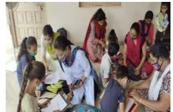
Career Guidance and Counselling