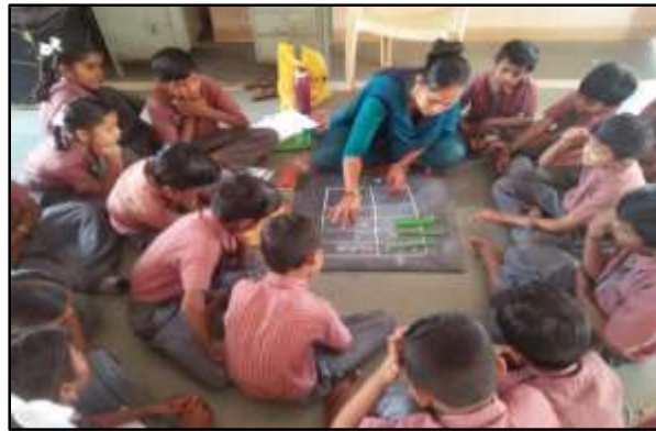
Learning Levels Teacher Training Shiksha Saathi